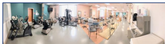
Sepulveda Ambulatory Care Center

Residents will have 13 paid vacation days, as well as 4 hours of sick leave accrued per pay period. Residents will also get 10 paid federal holidays, and optional health, vision, and dental benefits.